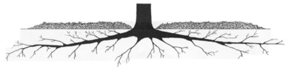
Figure 2. Mulch layer should be 2-4 inches thick and not be against the trunk.